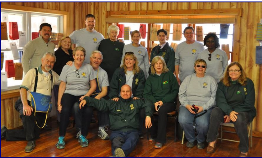
RYLA Spring Weekend Rotarians!! Join US in 2017!

June – DCM: Calendar meeting, program year updates, & planning sessions